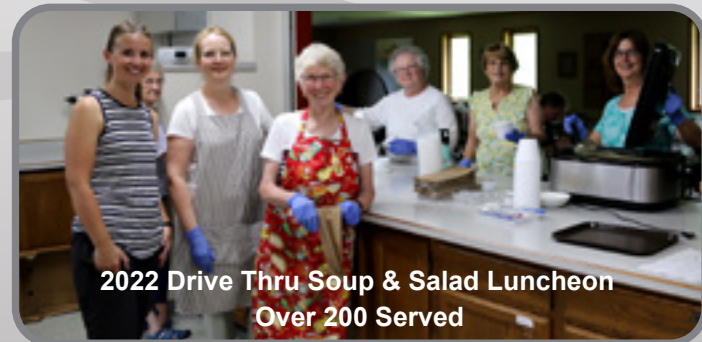
2022 Drive Thru Soup & Salad Luncheon Over 200 Served