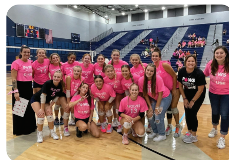
SUN PRAIRIE WEST